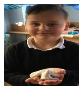
Year 2 Local Area Walk